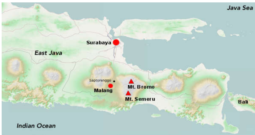
Figure 1 – The Map of Saptorenggo Village, Malang District, East Java

At the present time, infrastructure development in Indonesia is enhanced. In accordance to the visions and missions stated by Mr. President Joko Widodo, national development should start from outskirts areas by strengthening them as the parts of the nation. Constructing more infrastructures especially highways is an important key to enhance the connectivity and equitable development among regional areas in Indonesia.