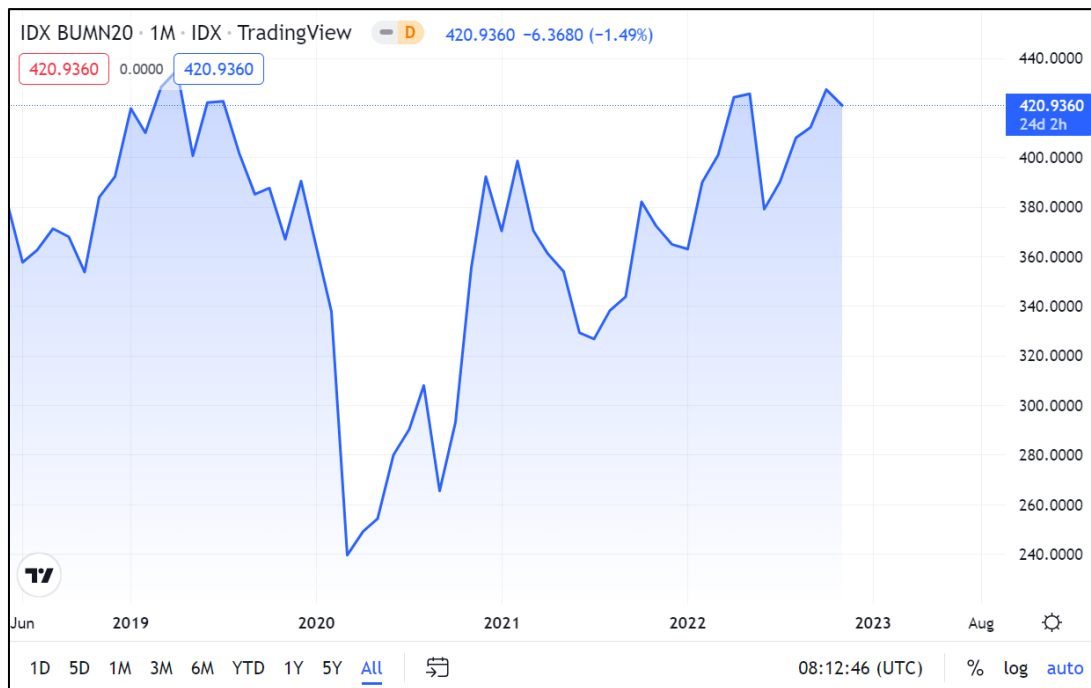
Figure 1 – IDX BUMN20 Summary Chart (Source: https://www.tradingview.com , 2023)